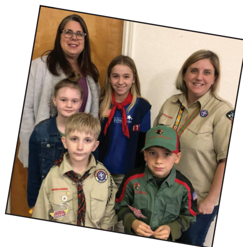
LA GRANGE CHURCH OF CHRIST, LA GRANGE, TX