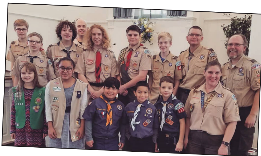
CHURCH OF CHRIST IN FALLS CHURCH, FALLS CHURCH, VA