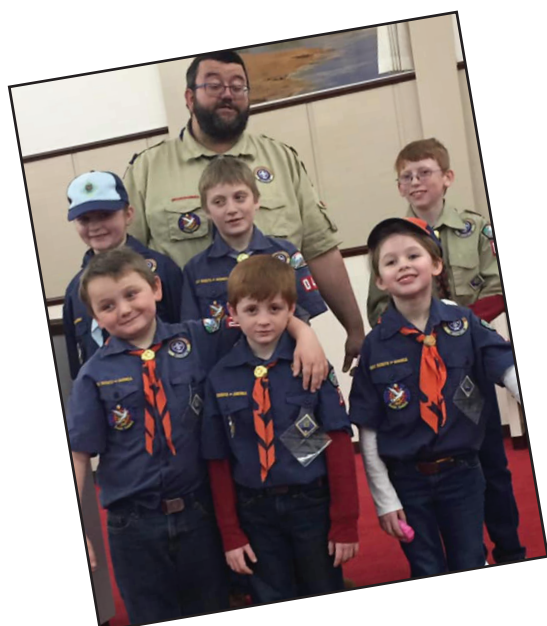
HOLDEN AVENUE CHURCH OF CHRIST, NEWPORT, AR