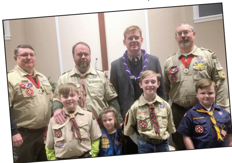
TUSCULUM CHURCH OF CHRIST, NASHVILLE, TN