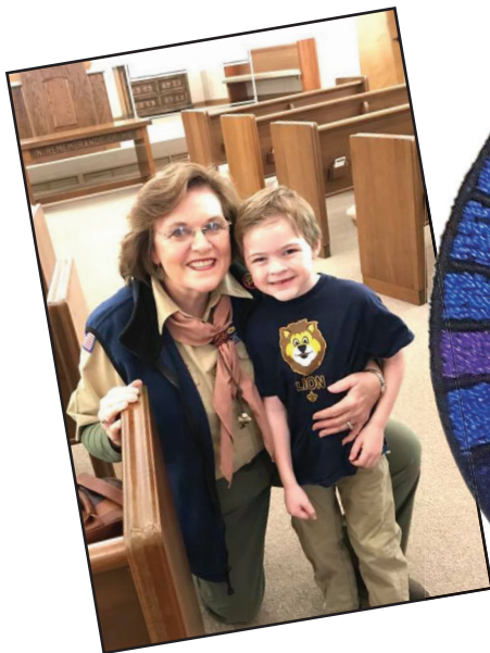
BOLIVAR CHURCH OF CHRIST IN CLEVELAND, MS