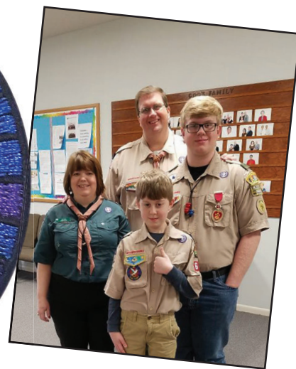
LONGVIEW CHURCH OF CHRIST IN LONGVIEW, TX