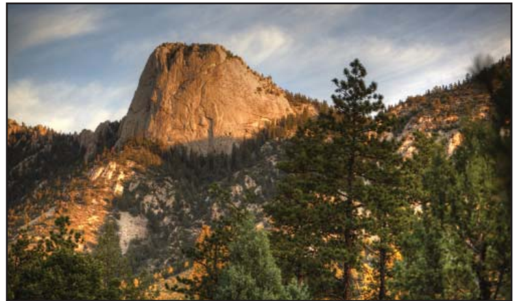
PHILMONT'S LEGENDARY TOOTH OF TIME LANDMARK

For those family members not attending the seminar, Philmont offers various staffed activities for the entire family. As an option, youth aged 14 - 20 whose parent(s) attend(s) the Philmont 2014 conference will also be guaranteed a backpacking experience on a Mountain Trek, at