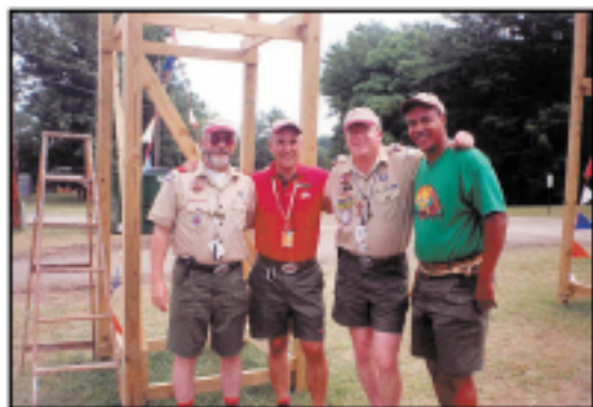
Top: Scouts and leaders line up for the 2001 Jamboree's Opening Ceremony.