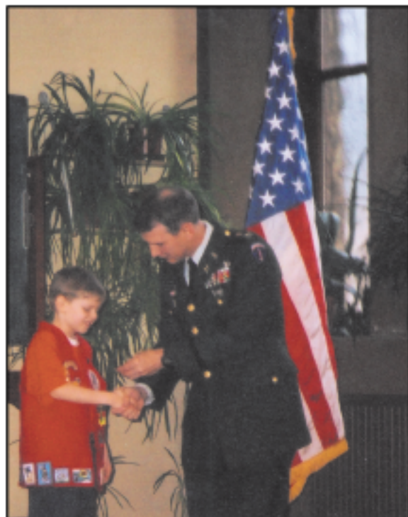
Left: Heidelberg, Germany