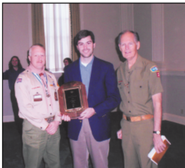
Above: Oklahoma City, Okla.